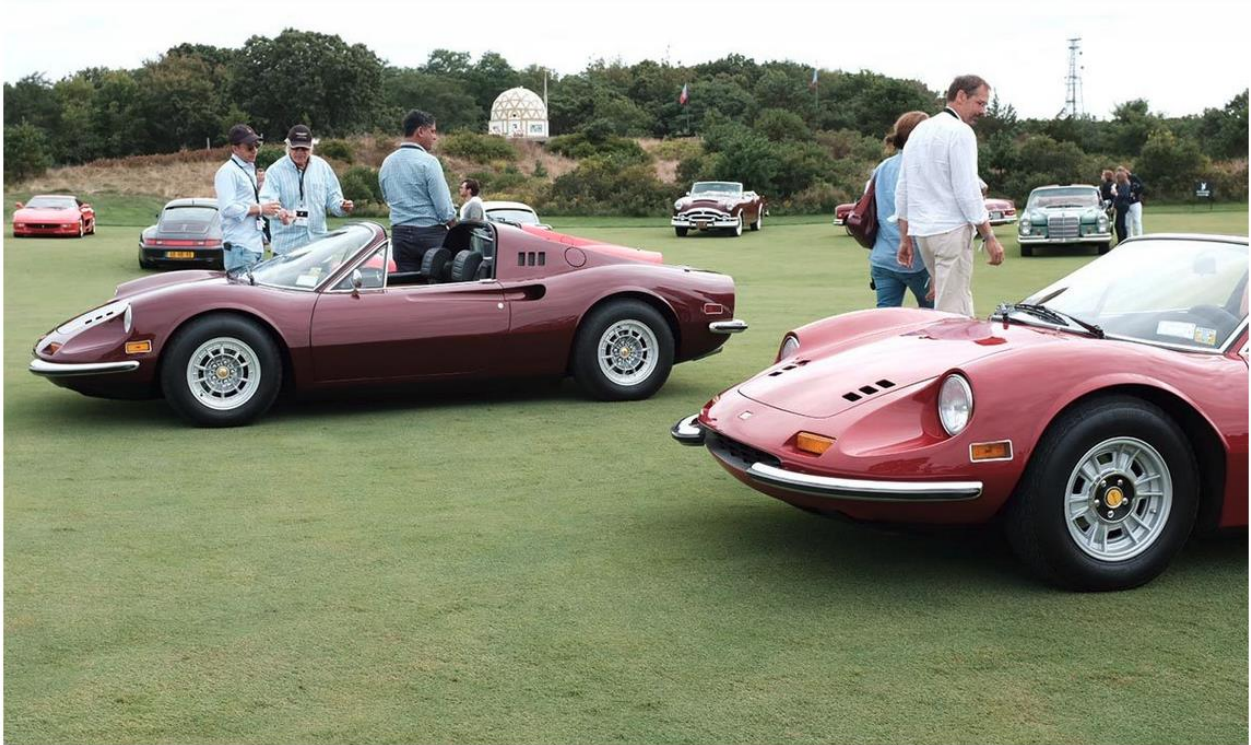
Ferrari Dino 246 GTS