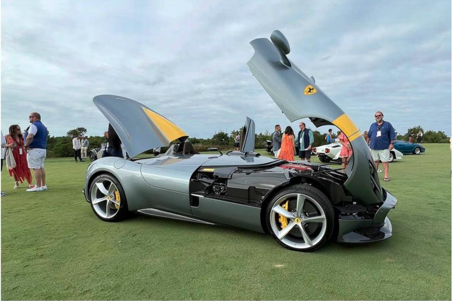
Ferrari Monza SP-1