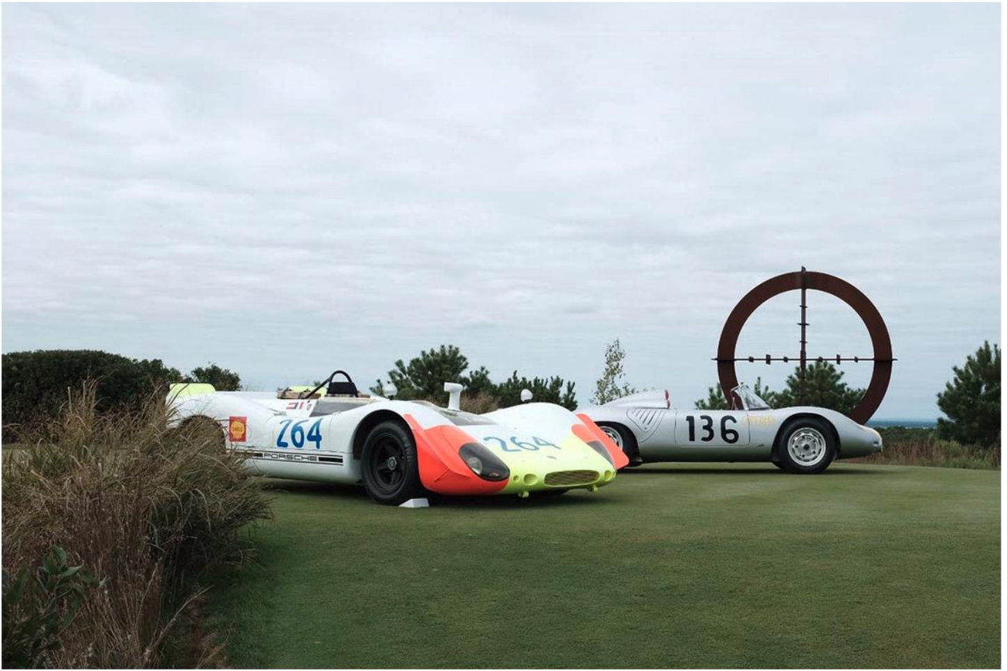
Porsche 908 & Porsche RSK Racecars