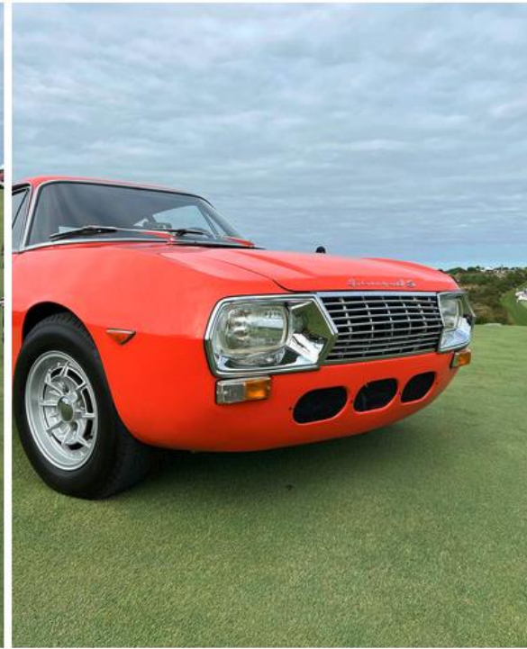
Lancia Fulvia Zagato