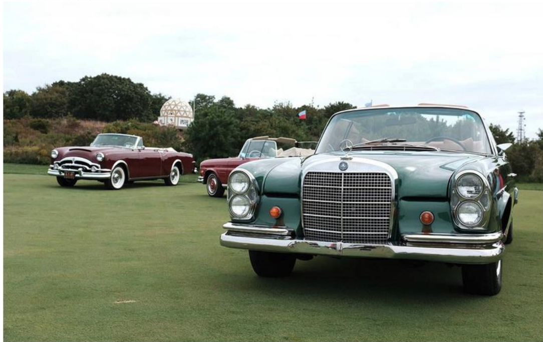
Packard Caribbean & Mercedes-Benz 280SE Cabriolet in Moss Green