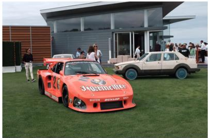
Porsche 935 Racecar