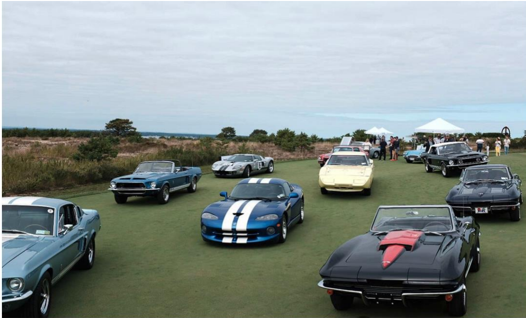
20th Century American Horsepower