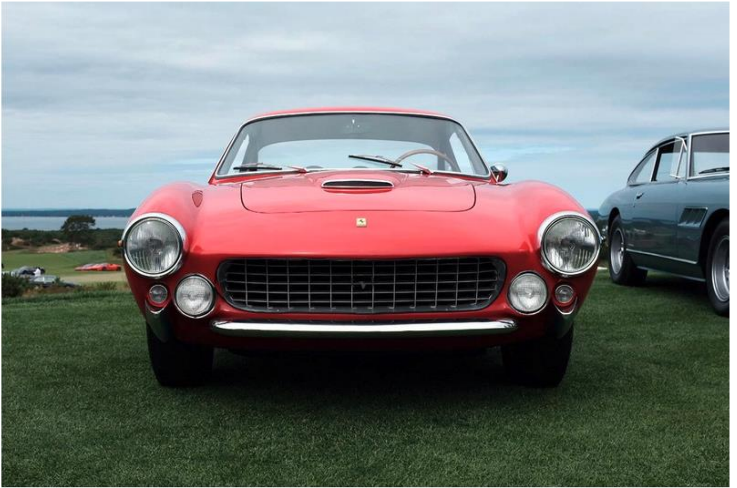
Ferrari 250GT Lusso