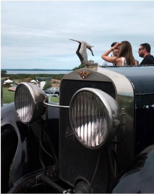
1921 Hispano-Suiza Hood Ornament