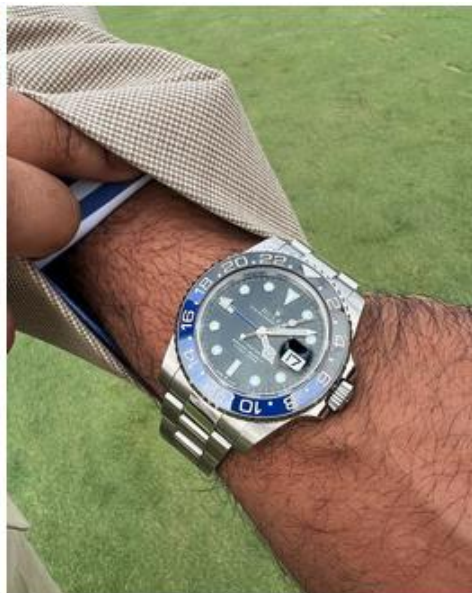
Rolex GMT-Master II