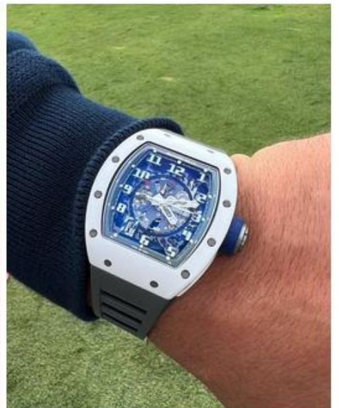
Richard Mille RM030 Polo Club de Saint-Tropez