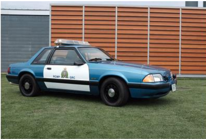
Ford Mustang 5.0 - Royal Canadian Mounted Police Car