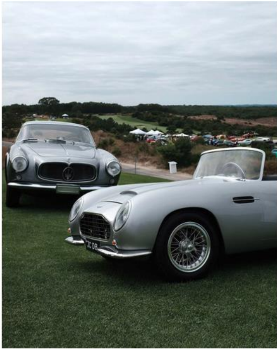
Maserati A6G-2000 Allemano & Aston Martin DB5 Kids Car