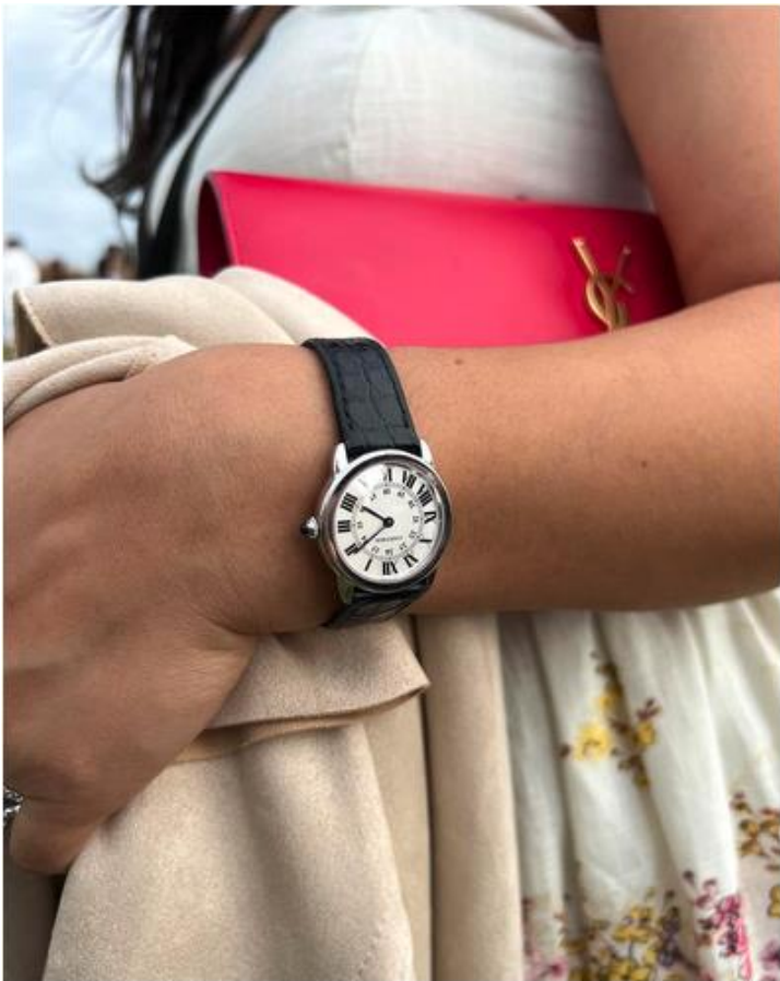
Cartier Ronde Solo de Cartier watch