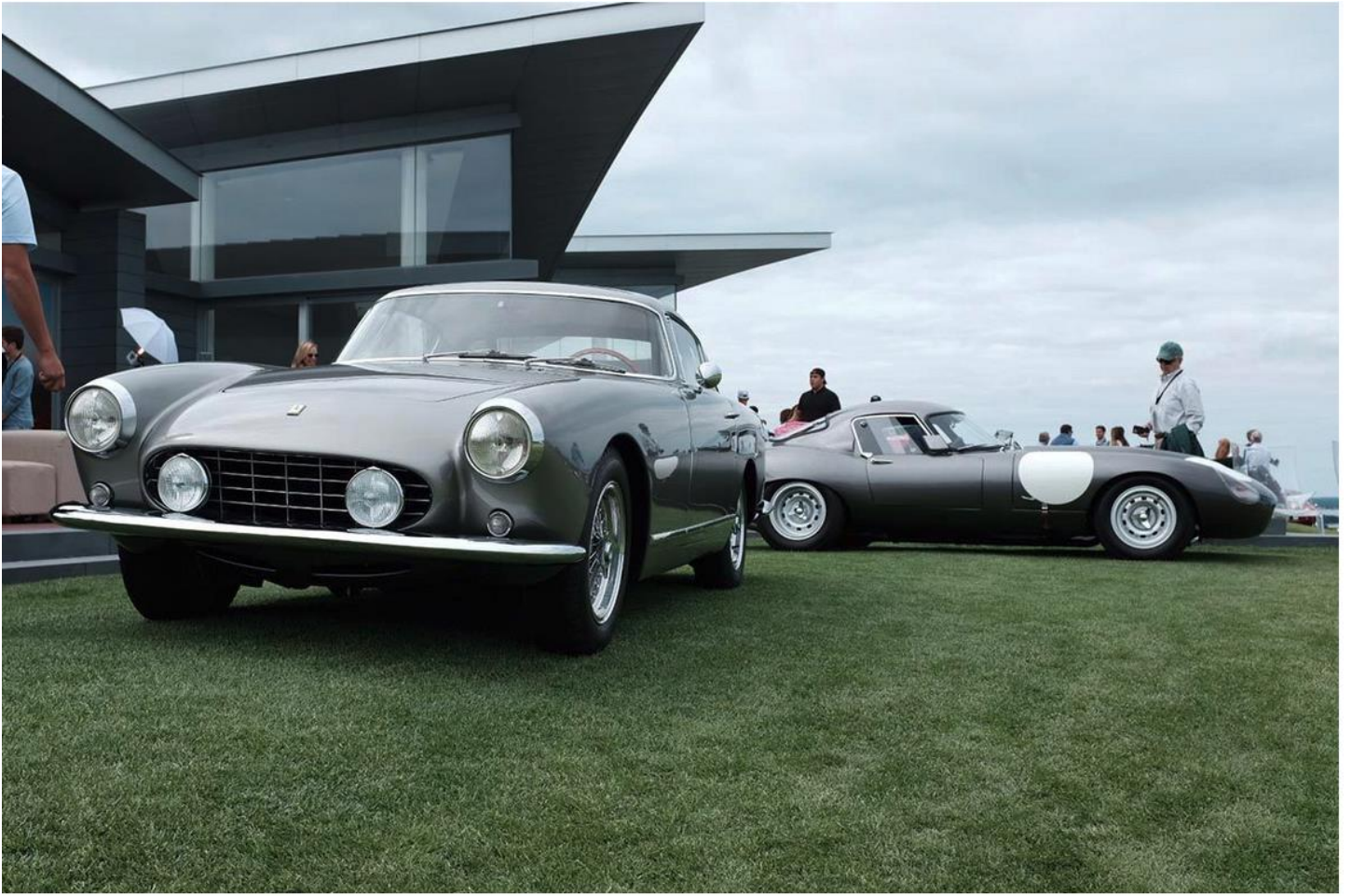
Ferrari 250 & Jaguar E-Type