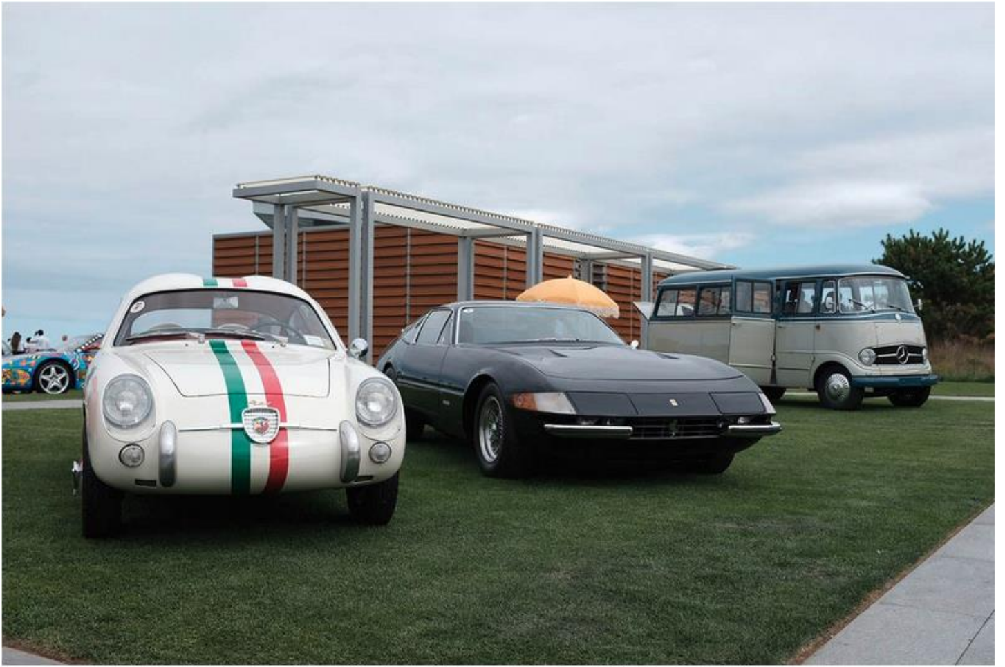
Fiat Abarth Zagato, Ferrari Daytona, Mercedes-Benz Tourist Bus