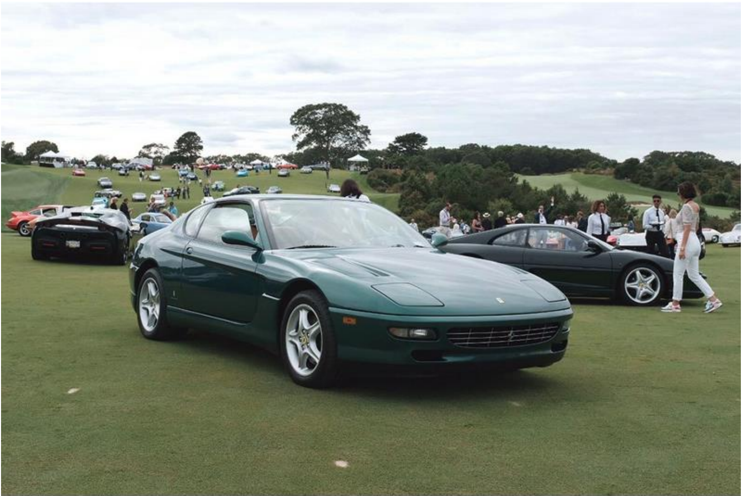
Ferrari 456 in Verde Mugello