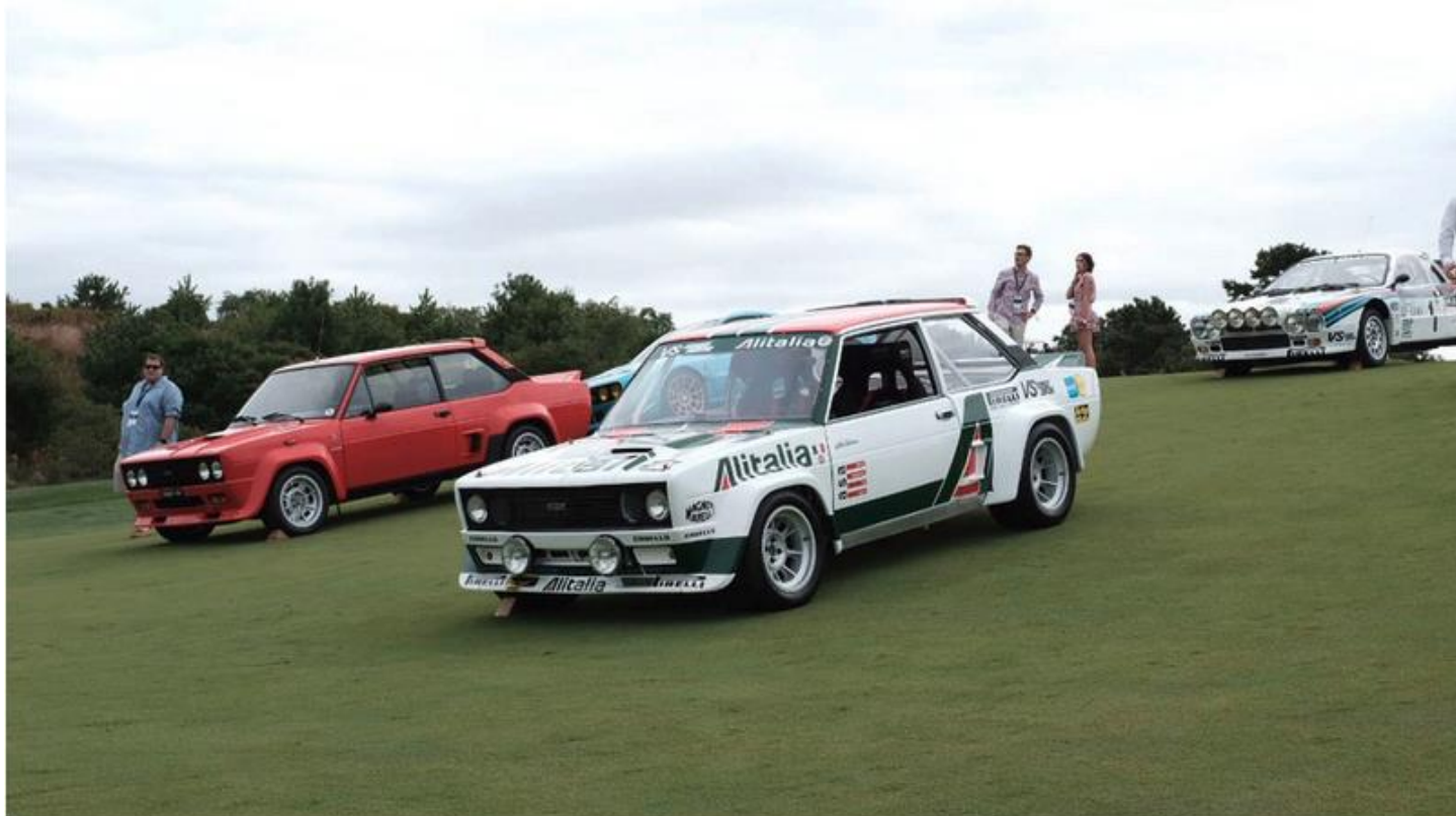
Lancia 131 ABARTH

But, of course, like any good party – it's the people that really make it special. The fantastic people you run into as you wander the greens are as interesting and eclectic as the cars on display. People from fashion, finance, and art – many wandering with cameras in hand. You never know who you might run into – sometimes just admiring the same car as you. Impromptu conversations abound.