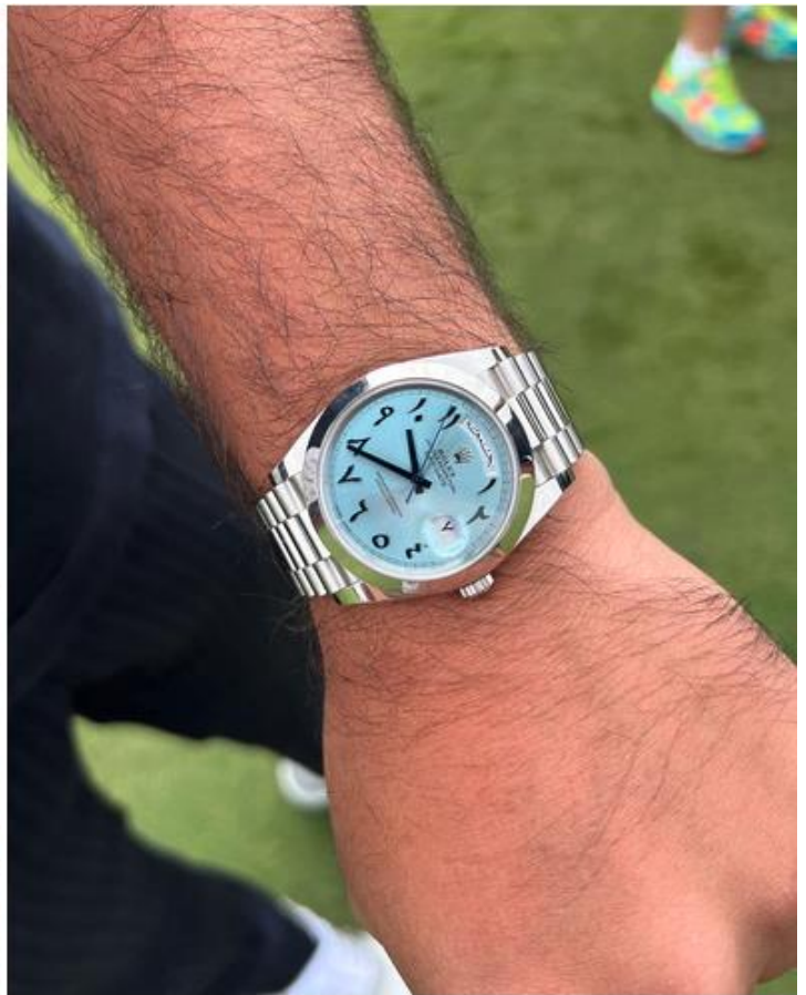
Rolex Day-Date 40mm Ice Blue Arabic Dial Platinum