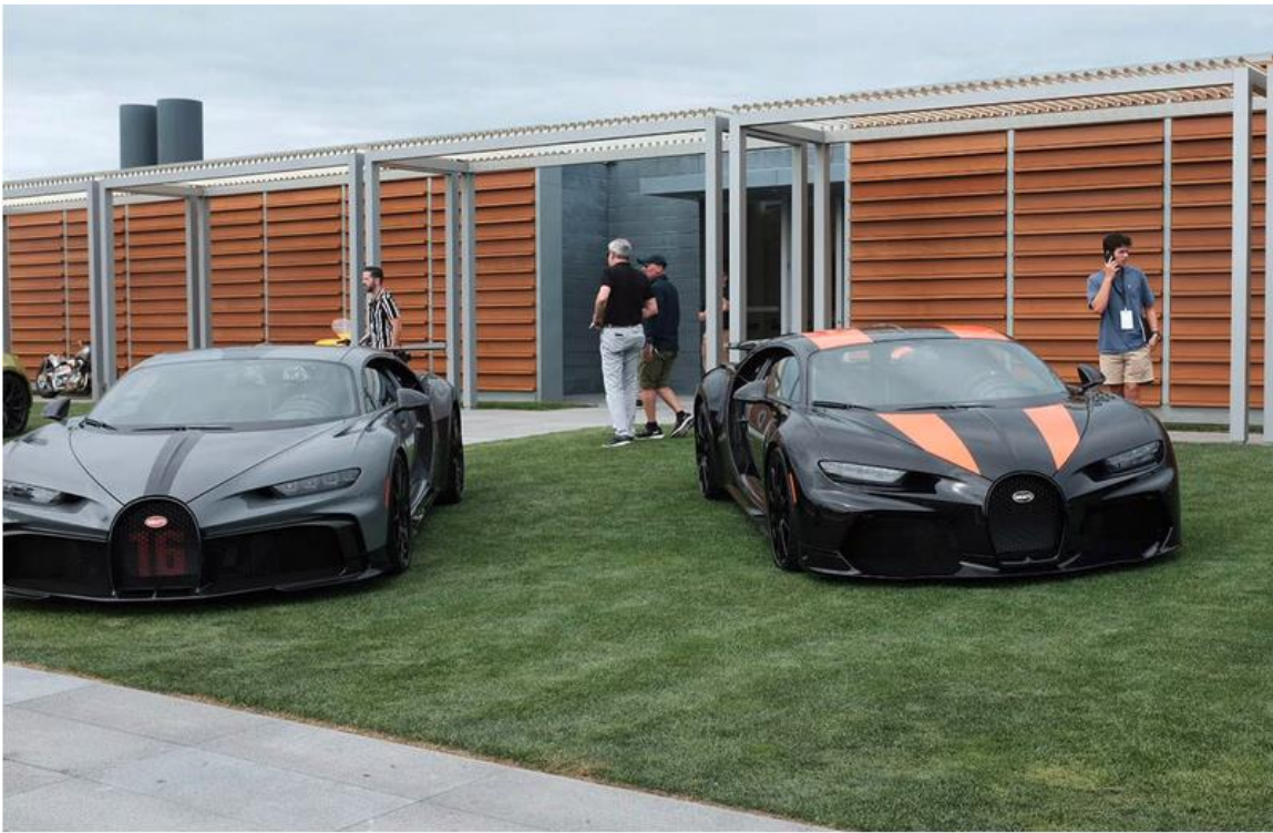
A Pair of Bugatti Chiron