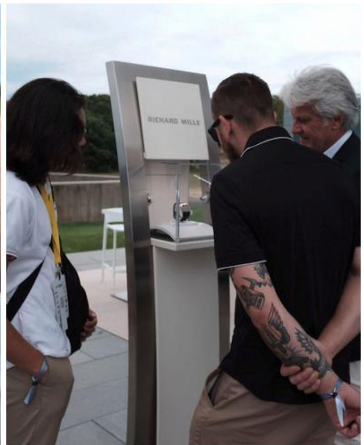
Richard Mille RM UP-01 Ferrari