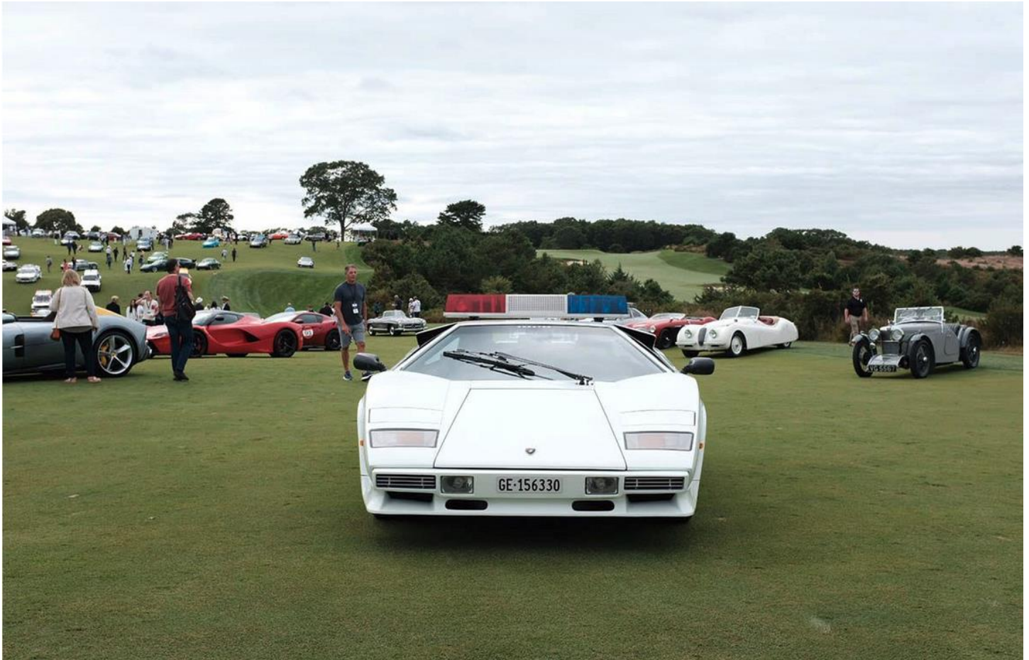
Lamborghini Countach, 1982 Monaco Grand Prix Pace Car

Beautiful displays that get you wandering across the lawns and up to the top of that 18th hole, socializing all the way, is the goal of The Bridge. Stops along the way, hosted by incredible food and wine sponsors, offer everything from lobster rolls to authentic Arrosticini cooked on open flames.