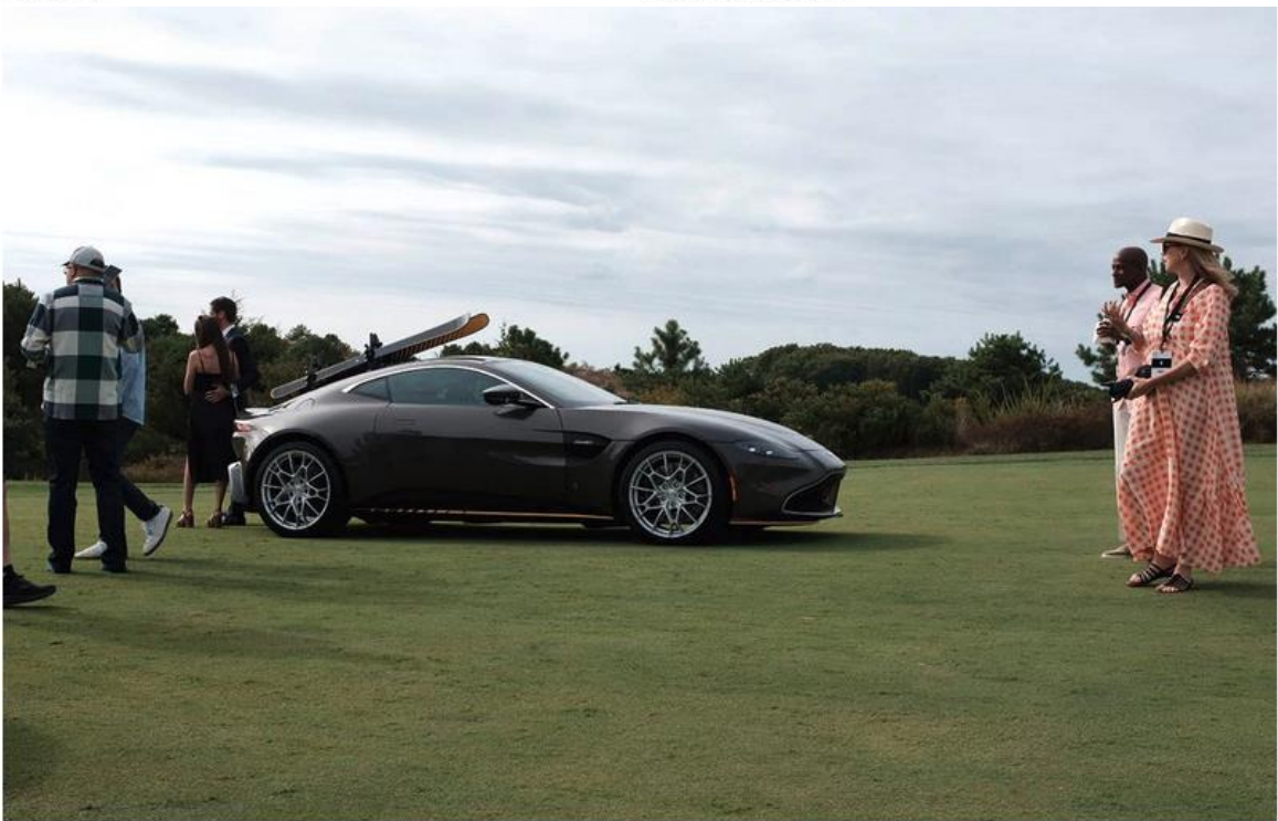
Aston Martin V8 Vantage - James Bond Edition