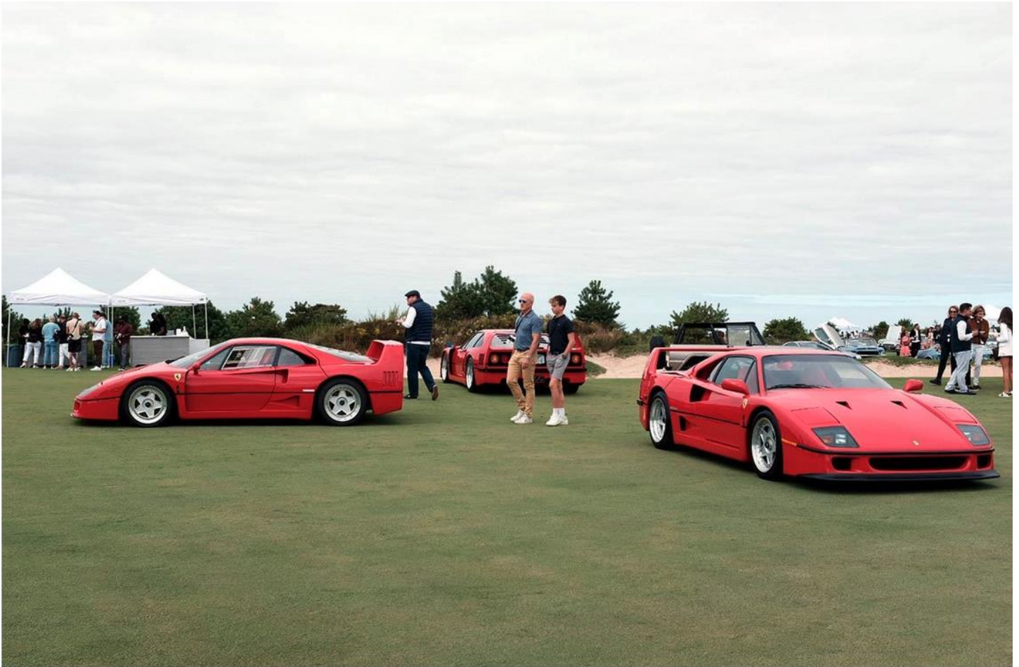
A Flock of Ferrari F40