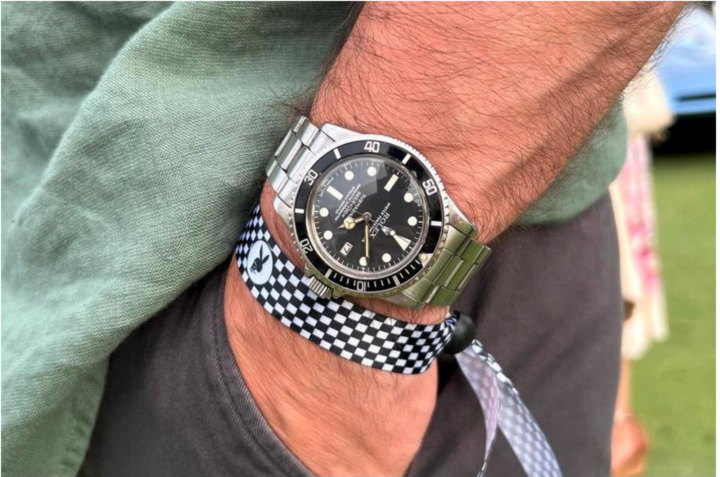
Vintage Oyster Perpetual Rolex Submariner

While there were some fantastic Richard Milles in the audience, the attendees' wrist wear left no stone unturned: Platinum Rolex Day-Dates, Cartiers, ceramic Panerai's, and, of course, a Rolex Daytona or two rounded out some of the wrist wear that caught my eye.