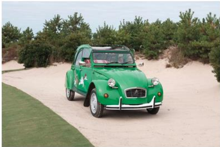
Citroen 2CV Sauss Ente