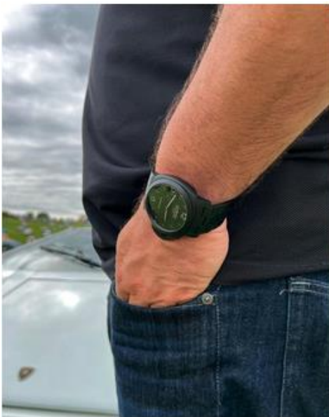
Panerai Luminor 1950 Tuttonero 3 Days GMT – PAM438