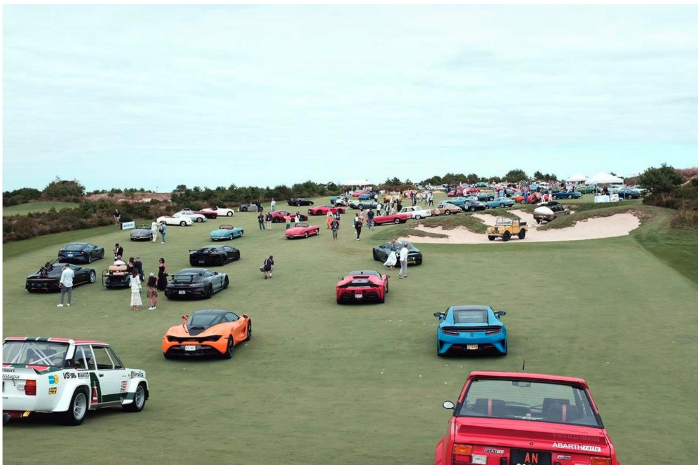
The Bridge VI Presented by Richard Mille

As the sun went down over the Peconic Bay, one of my personal favorite parts of The Bridge began – the parade of cars that start departing, one-by-one, lights on, engines rumbling, as they crawl out along the historic main straight of The Bridge. More than a few of us sat at the clubhouse and watched some of the all-time automotive greats drive past. The Bridge is an automotive garden party that always marks the end of summer, and I personally cannot wait to see what they bake up for 2023.