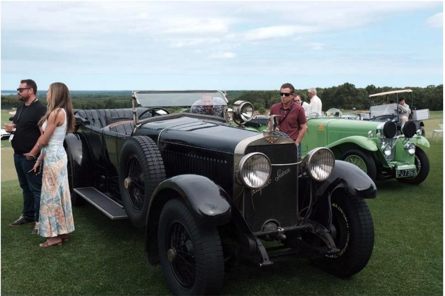
1921 Hispano-Suiza, in original preserved condition