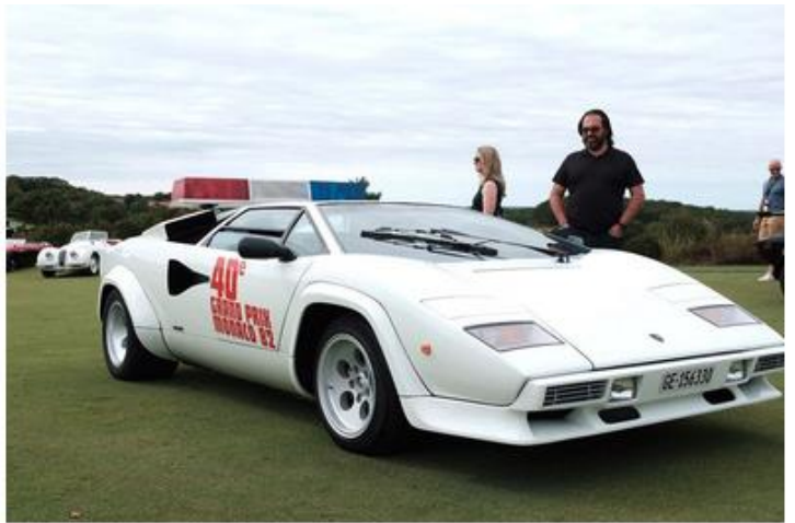
Lamborghini Countach, 1982 Monaco Grand Prix Pace Car