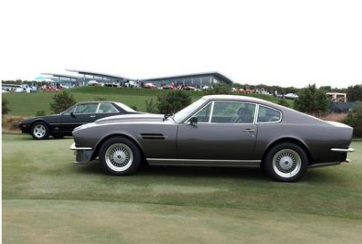
Ferrari 400i & Aston Martin 'Muscle Aston' Vantage