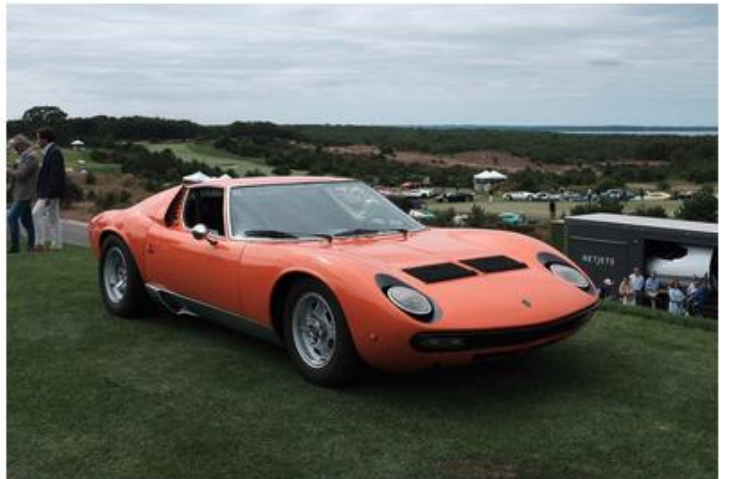
Lamborghini Miura SV