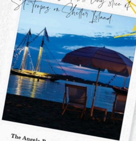
The Angela Bassett Hot Again Award Sunset Beach

Thanks to recent Chanel's fashion makeover of Sunset Beach, the rose is flowing and the joint is jumping at this tiny slice of St-Tropez on Shelter Island.