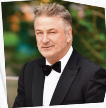
The Pontificate Award Alec Baldwin

RAIN OR SHINE, BLUE OR RED... YOU CAN COUNT ON ALEC BALDWIN FOR AN OPINION AND A PULPIT.