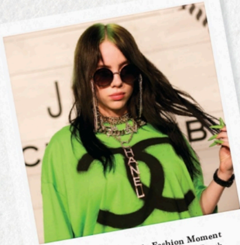
Most Memorable Fashion Moment Chanel J12 Takeover of Sunset Beach

NOTHING BEATS A CHANEL MAKEOVER. WE DIE FOR BILLIE EILISH AT THE MOMENT—SHE DID AN ACOUSTIC SET—AND IT WAS A RIOT TO SEE A POP STAR WHOSE LOOK IS THE OPPOSITE OF GLAM ROCK ALL THAT CHANEL JEWELRY.