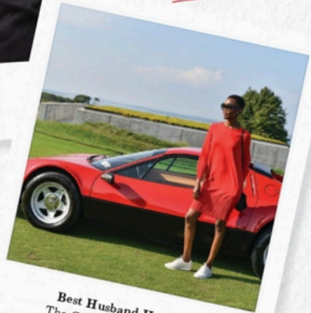
Best Husband-Hunting The Car Show at the Bridge

DIDN'T FIND A MATE AT SURF LODGE FRESNO OR HANGING BY THE YOGURT MACHINE AT BUDDHA BERRY? THE INVITE-ONLY AFFAIR ON THE LAWN AT THIS PRIVATE CLUB IN LATE SEPTEMBER MIGHT BE YOUR LAST SHOT TO GET TO ST. BARTS OR MUSTIQUE FOR CHRISTMAS.