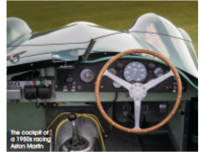
The cockpit of a 1950s racing Aston Martin