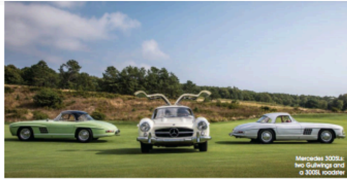
Mercedes 300SL: two Gullwings and a 300SL roadster