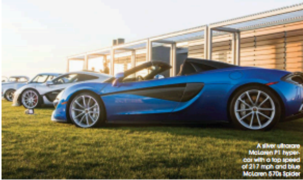
A silver ultra-rare McLaren P1 hypercar with a top speed of 217 mph and blue McLaren S70a Spider