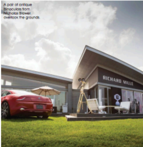
A pair of antique binoculars from Nicholas Storer overlook the grounds.