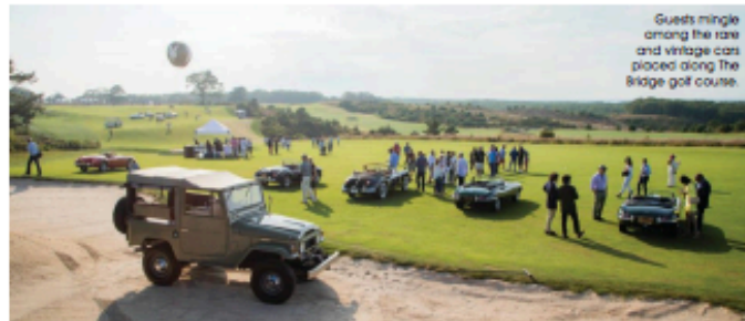
Guests mingle among the rare and vintage cars placed along the Bridge golf course.