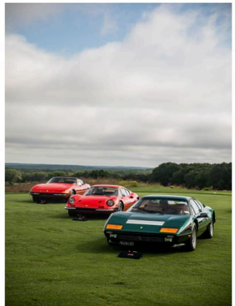
Installation view at the Bridge in 2021.